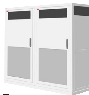
Dynamic DC 2x 350 kW 2x 500 A 150-920 V DC